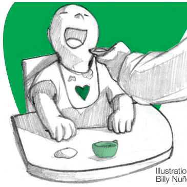
Illustration by Billy Nuñez, age 16